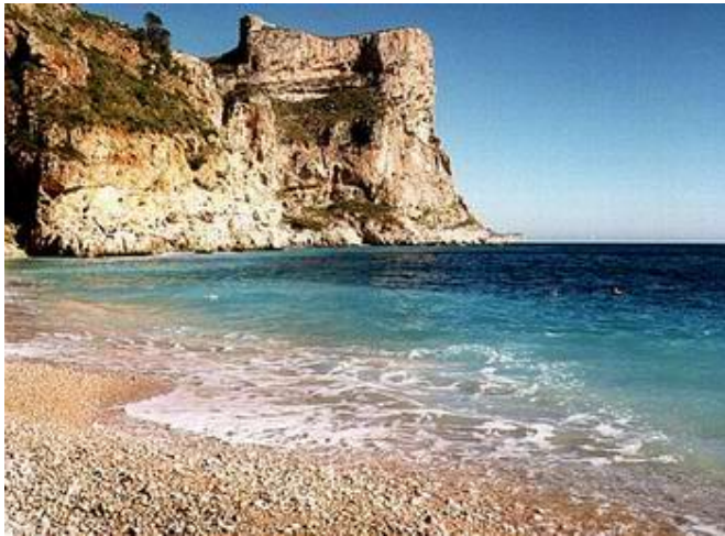
Costa del Sol